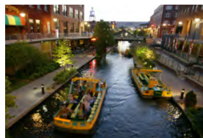
Oklahoma City has redesigned public spaces to make them more walkable.