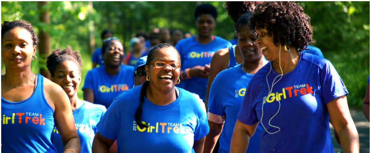
GirlTrek encourages women to walk every day.